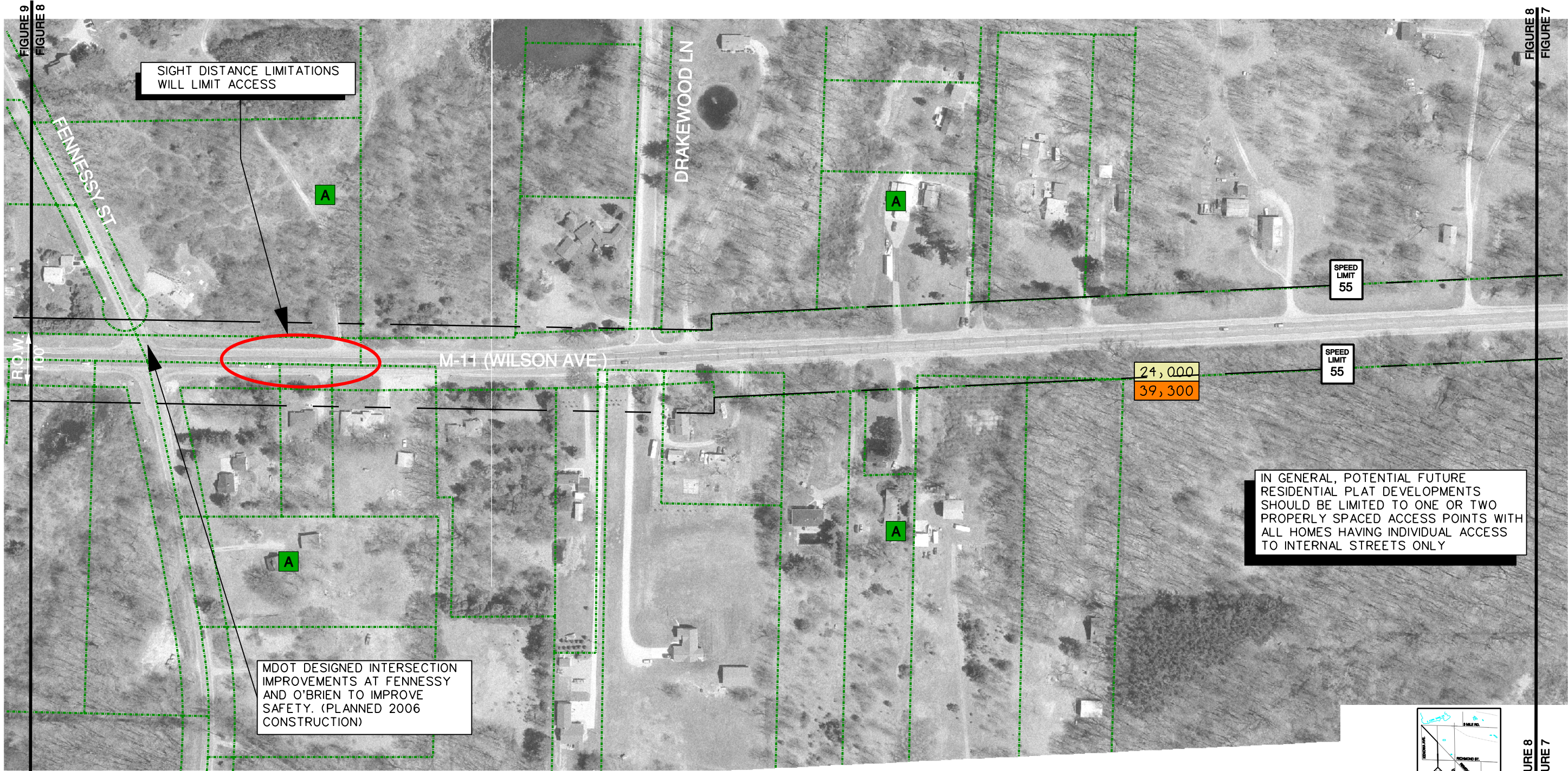
FIGURE 9 FIGURE 8