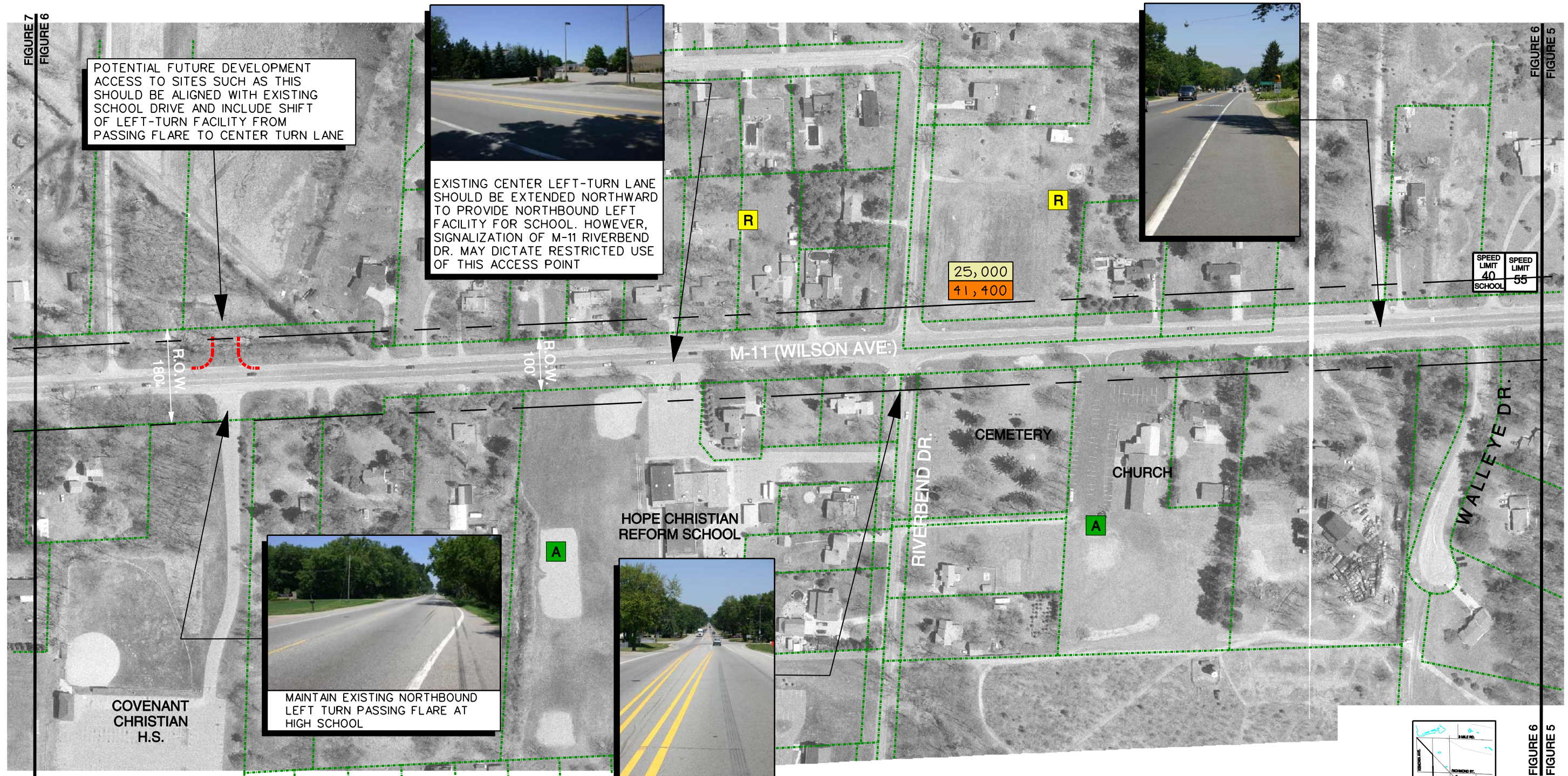
FIGURE 6 M-11 (WILSON AVENUE) ACCESS MANAGEMENT PLAN