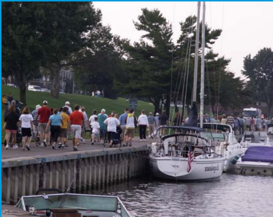
Grand River, Grand Haven Harbor