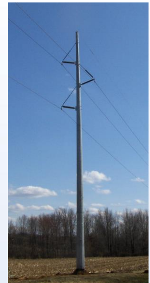
The new Four Mile – Wealthy structures will be similar to the one shown here.

ITC Holdings Corp., through subsidiaries ITC Transmission and Michigan Electric Transmission Company, LLC (METC), owns and maintains more than 8,700 circuit miles of high-voltage electric lines and 283 transmission stations and substations throughout Michigan's Lower Peninsula. As the nation's largest independent electric transmission company, ITC focuses solely on electric transmission to enhance reliability, relieve electric transmission congestion and connect all energy resources, including renewables, to customers in a non-discriminatory manner. ITC has been making significant investments in Michigan's transmission grid to improve reliability, safety and efficiency and lower the overall cost of delivered energy.