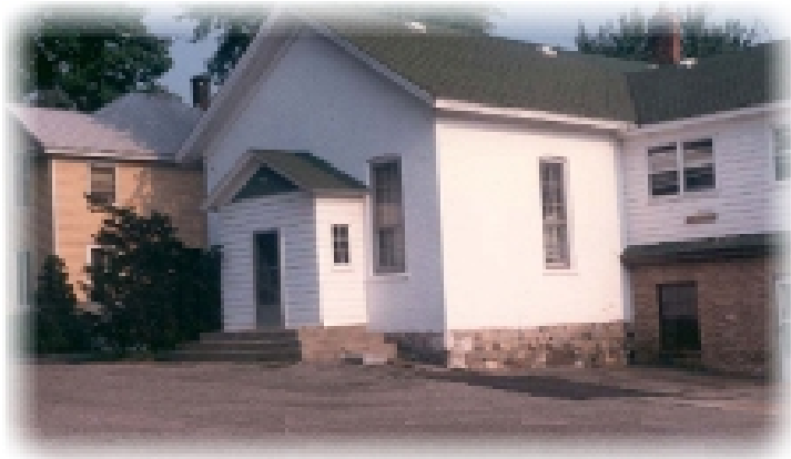
Former Walker Township Hall Leonard St & Covell Ave.